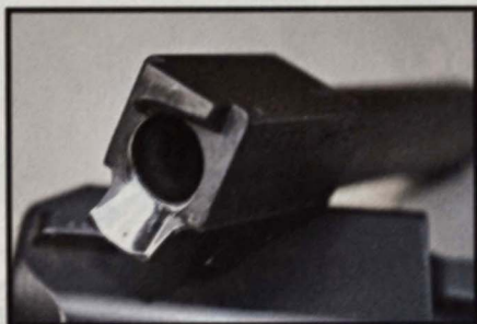
Feed ramp was polished to improve already flawless functioning. Glock perfection has gotten one step better after Cylinder & Slide applied their custom touches to the little pistol.

After almost four years, the most significant wear is on the left side of the pistol that rides against the leg. The contour lines on the front of the slide and the high spots on the left side of the slide show wear. Given the location on the pistol, this is to