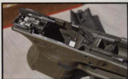
The internal parts of the G26 were also worked by the shop. The slide stop was Cerami Coted and the fire control parts were polished and radiused.

mixed, applied to the pistol and then allowed to harden. The coated parts are then baked at a very specific temperature to cure the finish. According to Laughridge, Cerami Cote is four times tougher than the popular polymer finishes.