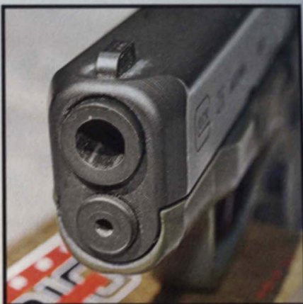
C&S crowned the barrel to protect muzzle and give the pistol an esthetically pleasing appearance.

Laughridge refinished the Glock 26 with his custom Cerami Cote finish. Cerami Cote is a flexible ceramic finish that is made up of a two-part epoxy base with ceramic color. The epoxy compound is