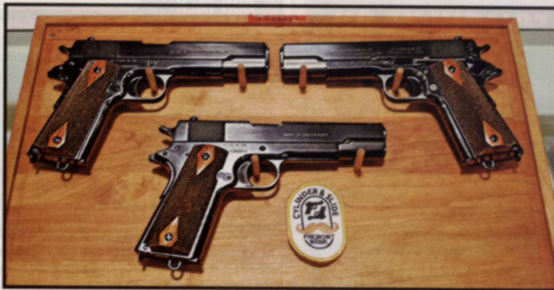
The three prototype pistols were marked with a standard Cylinder & Slide serial number. These three prototypes are not part of the limited run of 115 anniversary pistols the company is producing.

bona blue. Bill has partnered with master refinisher Doug Turnbull to match the bluing that was found on Colt pistols produced during 1911 and 1912. The hammer, trigger thumb safety, slide stop, pins, grip screws, magazine catch and magazine catch lock are heat blued by C&S using Niter Salts to give the parts that deep purple color. Each pistol is packaged in an original style two-piece Kraft paper box and wrapped in heavy brown waxed paper.