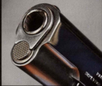
Even the checkering on the recoil spring plug is correct for the 1911 pistol, as are the dimensions of the barrel bushing.

Anyone who has held an old Colt 1911 will appreciate the craftsmanship that