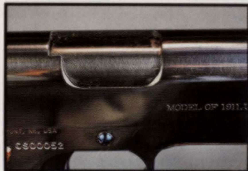
The original 1911 design features a small, high-cut ejection port reproduced on the anniversary pistols. This was modified in later variants.

As on the original pistols, the frame, slide, grip safety, mainspring housing, sear, disconnect, recoil spring guide, and recoil spring plug are finished in car-