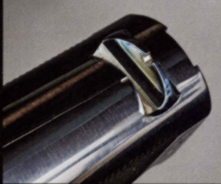
The rear sight consists of a rounded sight blade with a "U" notch that is 0.06 inches wide and 0.04 inches deep and is Niter blued.