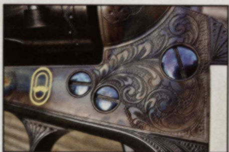
Powley did a gold inlay of Cylinder & Slide's mustache logo. The nitre-blued screws are an appropriate accent to the engraving.

Powley engraved the frame and barrel in a tasteful western scroll. The loading gate