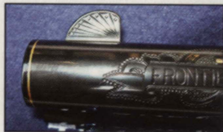
Powley finished off the US Firearms single-action with a sunburst design on the front sight blade and a gold band on the muzzle.

The rig was popularized by the Texas Rangers in the 1880's and features a straight